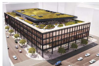
Martin Luther King Jr. Memorial Library, Washington D.C., US Size: 37,000 m 2 Year: 2014 - 2019