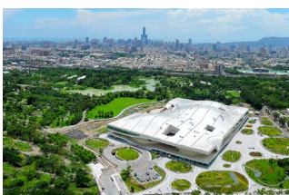
National Kaohsiung Centre for the Arts, Taiwan Size: 141,000 m 2 Year: 2006 - 2016