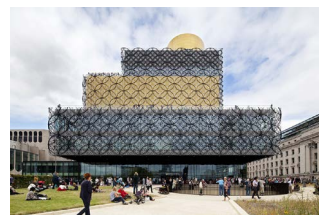
Library of Birmingham, UK Size: 35,000 m 2 Year: 2008 - 2013