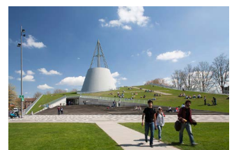
Delft University of Technology Library, NL Size: 15,000 m 2 Year: 1993 - 1998