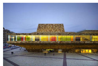
La Lotja Theatre and Conference Centre, Lleida, Spain Size: 37,500 m 2 Year: 2004 - 2010