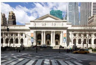
New York Public Library, US Size: 68,500 m 2 Year: 2015 - 2019