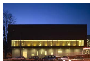
Het Marnix Swimming Pool and Sports Centre, Amsterdam, NL