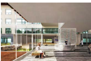
Rijndam Rehabilitation Centre, Rotterdam, NL