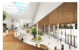
Zaans Medical Centre, Zaandam, NL