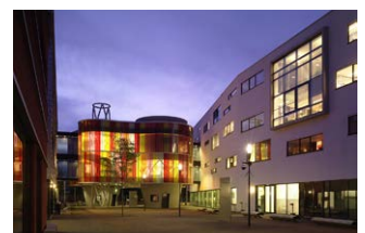
Da Vinci College, Dordrecht, NL