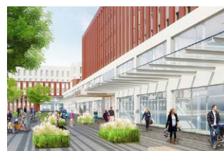
Health Care Boulevard, Zaandam, NL