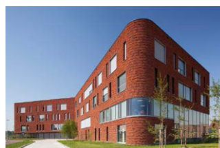
Calvin Groene Hart School for Secondary Education, Barendrecht, NL