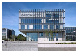
***Wexford County Council Offices, Wexford, Ireland