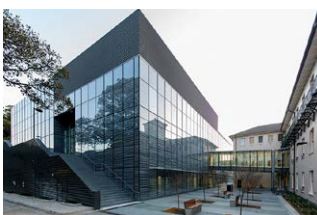
**University of Sydney, Australia