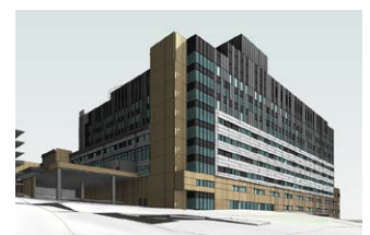
**Gosford Hospital Redevelopment, Sydney, Australia