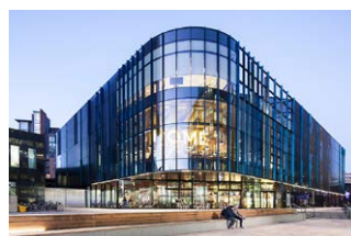
HOME Arts and Culture House, Manchester, UK