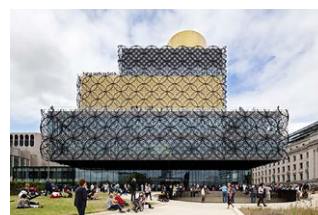
*Library of Birmingham, UK