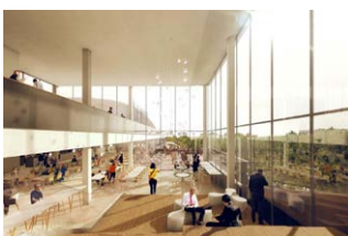
European Investment Bank, Luxembourg, LU