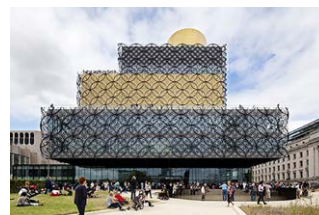
Library of Birmingham, UK Size: 35,000 m 2 Year: 2008 - 2013