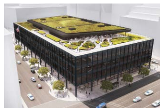
Martin Luther King Jr. Memorial Library, Washington D.C., US Size: 37,000 m 2 Year: 2014 - 2019