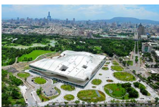
National Kaohsiung Centre for the Arts, Taiwan Size: 141,000 m 2 Year: 2006 - 2016