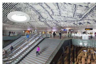
Municipal Offices and Train Station, Delft, NL Size: 28,320 m 2 Year: 2006 - 2017