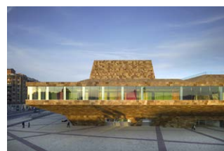
La Lotja Theatre and Conference Centre, Lleida, Spain Size: 37,500 m 2 Year: 2004 - 2010