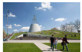
Delft University of Technology Library, NL Size: 15,000 m 2 Year: 1993 - 1998