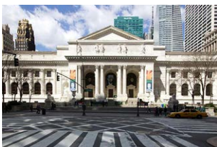
New York Public Library, US Size: 68,500 m 2 Year: 2015 - 2019