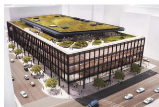
Martin Luther King Jr. Memorial Library, Washington D.C., US Size: 37,000 m 2 Year: 2014 - 2020