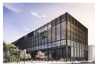
Manchester Engineering Campus Development, UK Size: 81,000 m 2 Year: 2014 - 2021