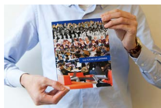
The Future of Learning Research Project Education Environments Year: 2013 - 2014