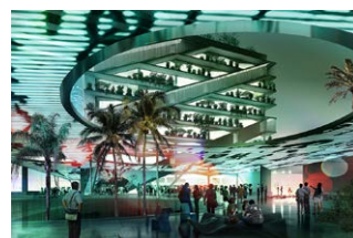
Kaohsiung Public Library, Taiwan Size: 38,000 m 2 Year: 2010 - 2011