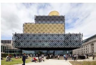
Library of Birmingham, UK Size: 35,000 m 2 Year: 2008 - 2013