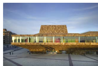
La Lotja Theatre and Conference Centre, Lleida, Spain