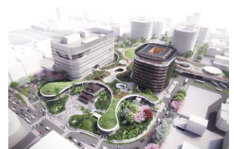
Kaohsiung Train Station, Kaohsiung City, Taiwan