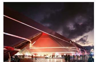
Three Cultural Centers & One Book Mall, Shenzhen, China