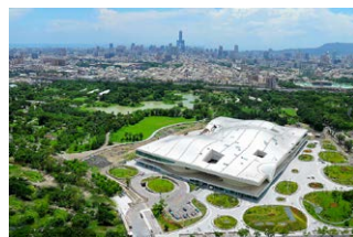
National Kaohsiung Centre for the Arts, Taiwan