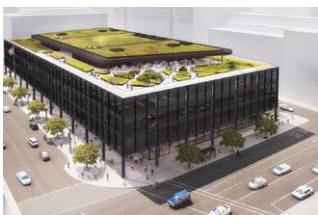
Martin Luther King Jr. Memorial Library, Washington D.C., US