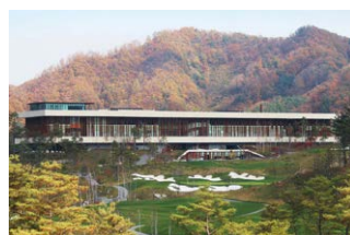
Whistling Rock Golf Clubhouse, Chuncheon, South Korea