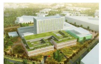
Haga Hospital, The Hague, NL Size: 32,000 m 2 Year: 2012