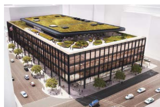
Martin Luther King Jr. Memorial Library, Washington D.C., US Size: 43,000 m 2 Year: 2014 - 2020