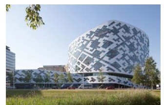
Hilton Amsterdam Airport Schiphol, NL Size: 43,150 m 2 Year: 2009 - 2015