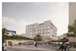
Heerlen City Hall and Municipal Offices, NL Size: 14,000 m 2 Year: 2017 - 2021