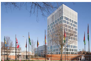
Eurojust , The Hague, NL Size: 18,475 m 2 Year: 2011 - 2016