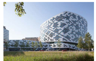
Hilton Amsterdam Airport Schiphol, NL Size: 43,150 m 2 Year: 2009 - 2015