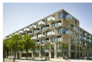
Osdorp Mixed-use Centre and Housing, Amsterdam, NL Size: 14,100 m 2 Year: 2005 - 2011