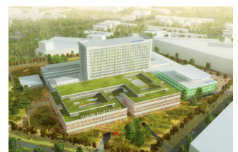
Haga Hospital, The Hague, NL Size: 32,000 m 2 Year: 2012