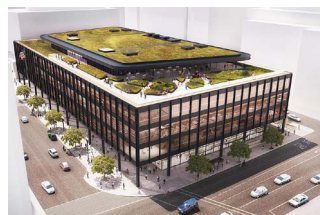
Martin Luther King Jr. Memorial Library, Washington D.C., US Size: 43,000 m 2 Year: 2014 - 2019