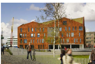
Amsterdam University College, NL Size: 5,800 m 2 Year: 2008 - 2012