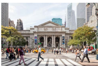
New York Public Library, US Size: 68,500 m 2 Year: 2015 - 2019