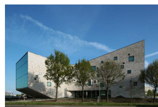
Rabobank Westelijke Mijnstreek Advice Centre, Sittard, NL Size: 6,800 m 2 Year: 2011 - 2014