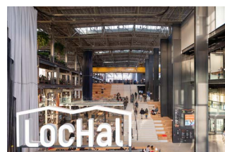
LocHal, Tilburg, NL Size: 7,000 m 2 Year: 2016 - 2018