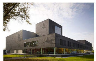
Fontys School of Sports Studies, Eindhoven, NL Size: 16,500 m 2 Year: 2009 - 2012