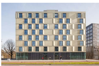
Student Campus Hotel, Rotterdam, NL Size: 9,500 m 2 Year: 2014 - 2016