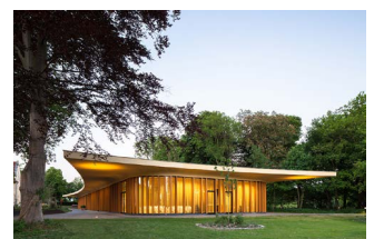
Pavilion Château St. Gerlach, Valkenburg aan de Geul, NL Size: 1,400 m 2 Year: 2014 - 2016