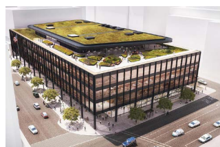
Martin Luther King Jr. Memorial Library, Washington D.C., US Size: 43,000 m 2 Year: 2014 - 2019