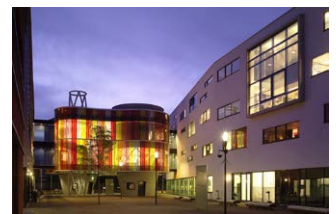
Da Vinci College, Dordrecht, NL