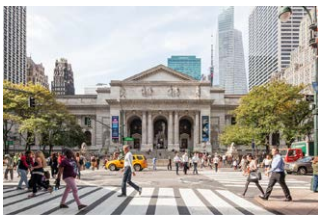
New York Public Library, US