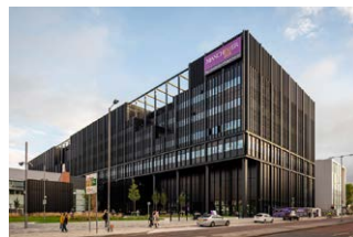
Manchester Engineering Campus Development, UK