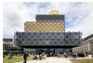
Library of Birmingham, UK

Research Project Education Environments Year: 2013 - 2014