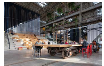
LocHal Library, Tilburg, NL