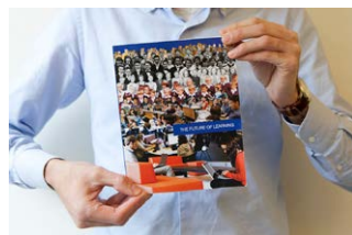
The Future of Learning

Research Project Education Environments Year: 2013 - 2014