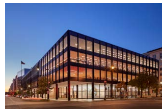
Martin Luther King Jr. Memorial Library, Washington D.C., US