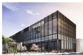
Manchester Engineering Campus Development, UK Size: 81,000 m 2 Year: 2014 - 2021