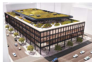
Martin Luther King Jr. Memorial Library, Washington D.C., US Size: 37,000 m 2 Year: 2014 - 2020