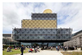
Library of Birmingham, UK Size: 35,000 m 2 Year: 2008 - 2013