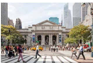
New York Public Library, US Size: 68,500 m 2 Year: 2015 - 2021