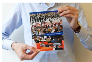
The Future of Learning Research Project Education Environments Year: 2013 - 2014