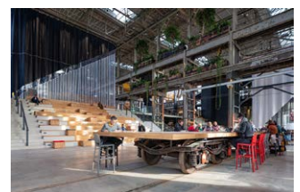
LocHal Library, Tilburg, NL Size: 7,000 m 2 Year: 2016 - 2018