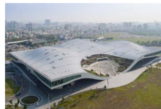
National Kaohsiung Centre for the Arts, Taiwan