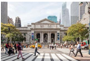
New York Public Library, US