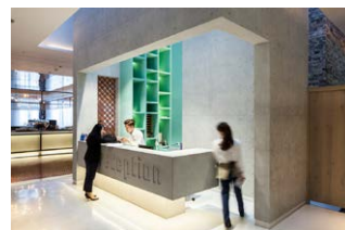
Hotel The Place, Tainan, Taiwan