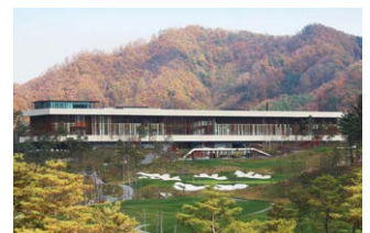
Whistling Rock Golf Clubhouse, Chuncheon, South Korea