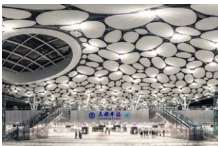
Kaohsiung Station, Taiwan