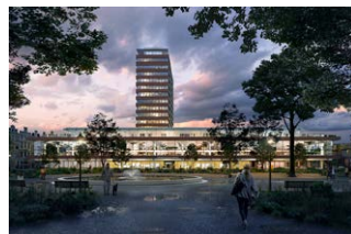
De Nederlandsche Bank, Amsterdam, NL