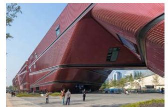
Longgang Cultural Centre, Shenzhen, China