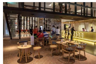
Hotel The Place, Tainan, Taiwan