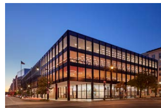
Martin Luther King Jr. Memorial Library, Washington D.C., US