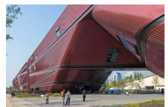
Longgang Cultural Centre, Shenzhen, China Size: 99,000 m 2 Year: 2012- 2019