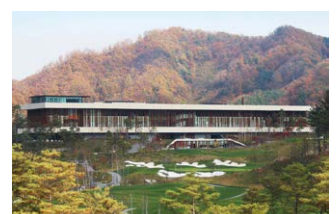
Whistling Rock Golf Clubhouse, Chuncheon, South Korea Size: 7,500 m 2 Year: 2007 - 2012