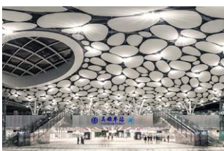
Kaohsiung Station, Taiwan Size: 182,000 m 2 Year: 2014-2024