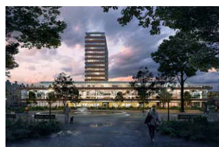
De Nederlandsche Bank, Amsterdam, NL Size: 65,000 m 2 Year: 2018 - 2023