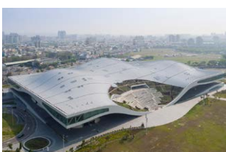
National Kaohsiung Centre for the Arts, Taiwan Size: 141,000 m 2 Year: 2007 - 2018