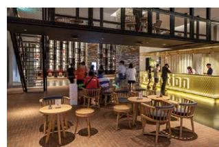
Hotel The Place, Tainan, Taiwan Size: 14,500 m 2 Year: 2011 - 2014