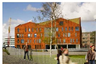
Amsterdam University College, NL