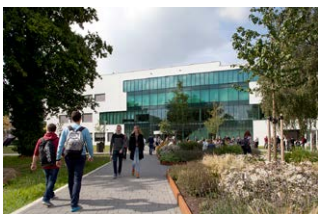
Fontys University of Applied Sciences, Eindhoven, NL