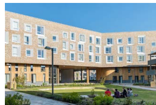
Key Worker Housing, University of Cambridge, UK