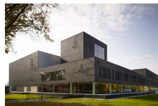
Fontys School of Sports Studies, Eindhoven, NL