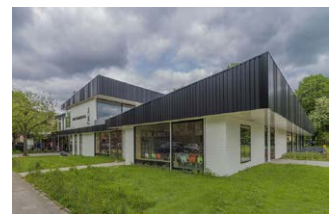
Anne Frank Primary School, Utrecht, NL