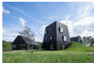
Villa Vught, NL