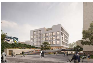
Heerlen City Hall and Municipal Offices, NL