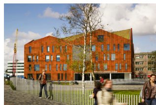
Amsterdam University College, Amsterdam, NL