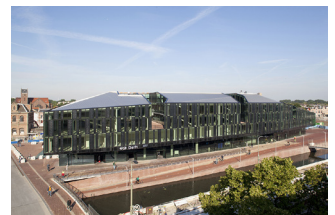
Municipal Offices and Train Station, Delft, NL