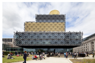
Library of Birmingham, UK