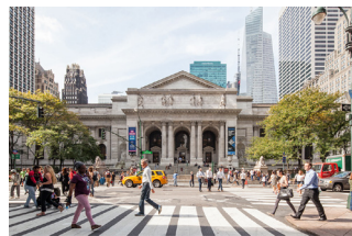
New York Public Library, US