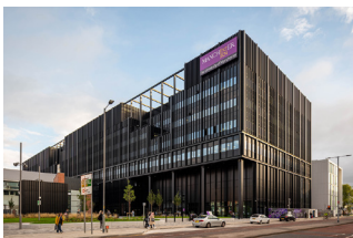
Manchester Engineering Campus Development, UK