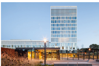
Eurojust (EU Agency), The Hague, NL