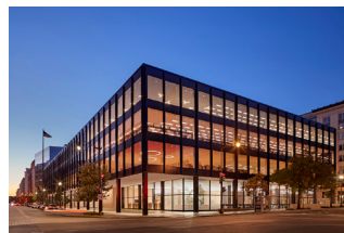
Martin Luther King Jr. Memorial Library, Washington D.C., US