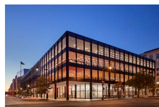
Martin Luther King Jr. Memorial Library, Washington D.C., US