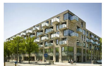
Osdorp Mixed-use Centre and Housing, Amsterdam, NL