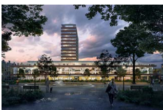
De Nederlandsche Bank, Amsterdam, NL