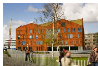
Amsterdam University College, NL