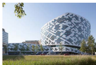
Hilton Amsterdam Airport Schiphol, NL