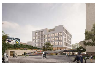
Heerlen City Hall and Municipal Offices, NL