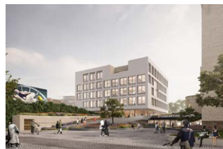
Heerlen City Hall and Municipal Offices, NL