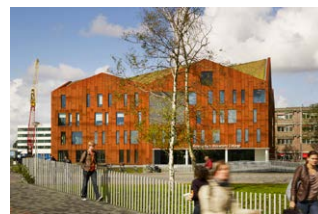
Amsterdam University College, NL