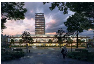
De Nederlandsche Bank, Amsterdam, NL