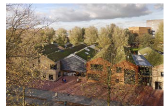
Kiem Special Care School, Dordrecht, NL