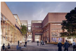
Generalsanierung Gasteig, München, Germany