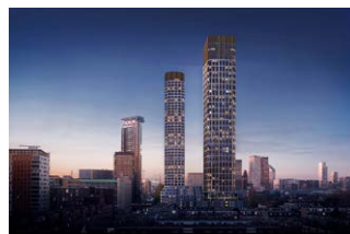
The Grace, The Hague, NL