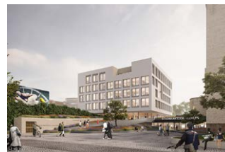
Heerlen City Hall and Municipal Offices, Heerlen, NL