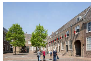
Het Hof van Nederland Museum, Dordrecht, NL