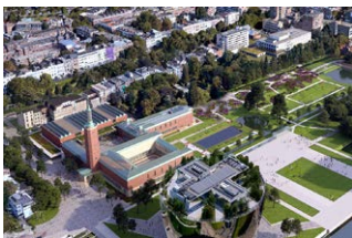
Museum Boijmans Van Beuningen, Rotterdam, NL