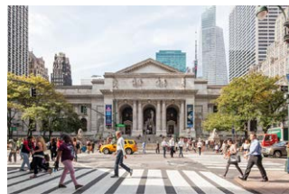
Stephen A. Schwarzman Building, New York Public Library, US