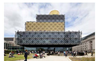
Library of Birmingham, UK