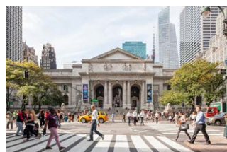
Stephen A. Schwarzman Building, New York Public Library, US