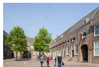
Het Hof van Nederland Museum, Dordrecht, NL