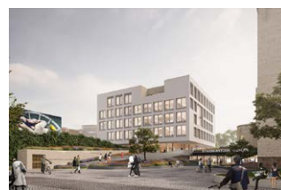
Heerlen City Hall and Municipal Offices, Heerlen, NL