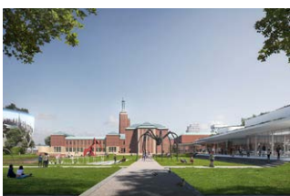
Museum Boijmans Van Beuningen, Rotterdam, NL