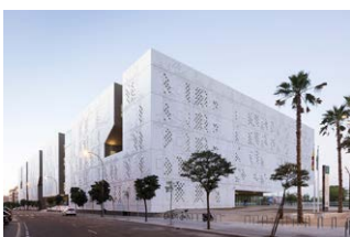
Palace of Justice, Córdoba, Spain